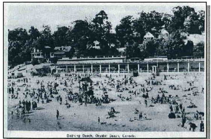
For over 100 years, beach-goers have flocked to the waters of Lake Erie and the white sands of Crystal Beach.