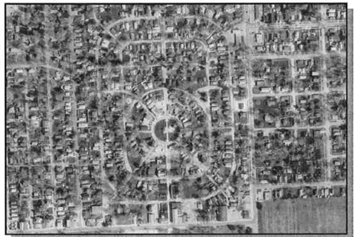
The core area of Crystal Beach is laid out in this unique radial pattern which has its origins as a religious camp. The central circle was designated as a place of worship, and campsites were laid out on paths that radiated from the central focus area.